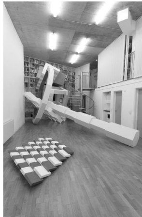
0.12 In Tempore That Shaped the World , 2013. (see fig. 11.16)