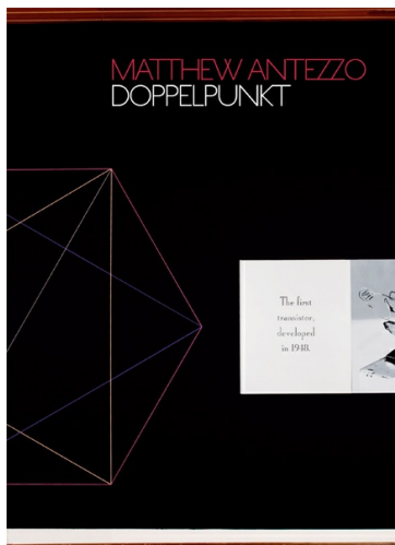
1. First transistor II 1998, oil on canvas, diptych, 98 x 152 cm